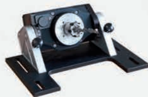
Real3D Rotation Unit G2